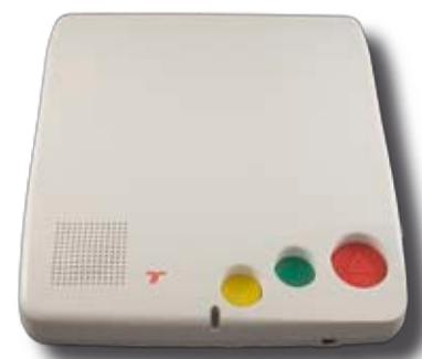
Antenna care phone

Incoming calls can be sent to a central monitor (PC), a DECT phone, a pager or even a PDA. With unicare® you also have the option to send the call to a monitor for example during the daytime and to a phone during the night.