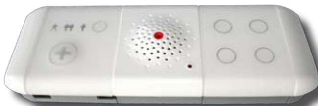
Call unit with speech and programmable buttons

CLB offers a call unit based on a modular concept and which can be configured to your demands. The modular system allows you to add modules for speech or an extra unit for free programmable buttons, which can for example be assigned to open a (central) door, control the voice communication, control the awnings or anything else you might think of.